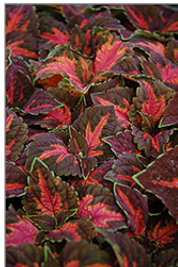
Superfine Rainbow Festive Dance Coleus foliage