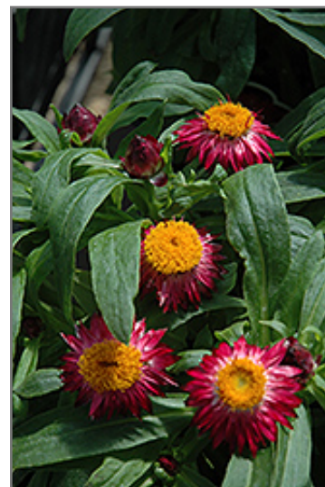
Mohave Dark Red Strawflower flowers