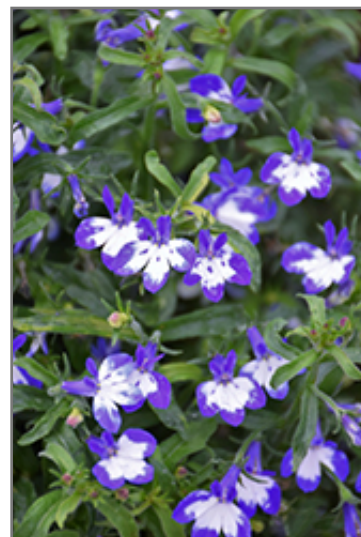
Super Star Lobelia flowers