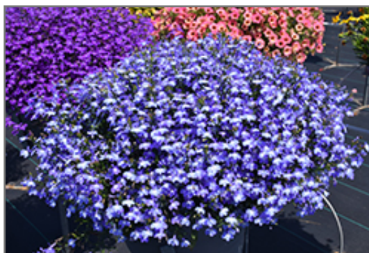
Techno Light Blue Lobelia in bloom