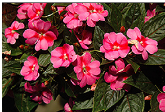
Harmony Marshmallow Cream New Guinea Impatiens flowers

Harmony Marshmallow Cream New Guinea Impatiens is recommended for the following landscape applications;