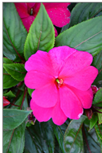
Florific Violet New Guinea Impatiens flowers

Florific Violet New Guinea Impatiens is recommended for the following landscape applications;