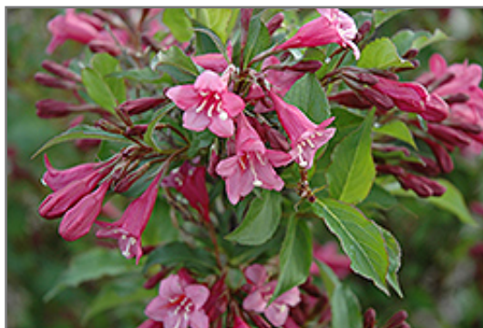
Rumba Weigela flowers