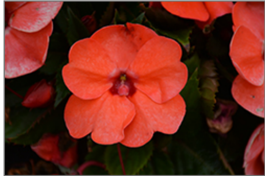
SunPatiens Compact Hot Coral New Guinea Impatiens flowers

This plant will require occasional maintenance and upkeep, and should not require much pruning, except when necessary, such as to remove dieback. It is a good choice for attracting bees and butterflies to your yard. It has no significant negative characteristics.