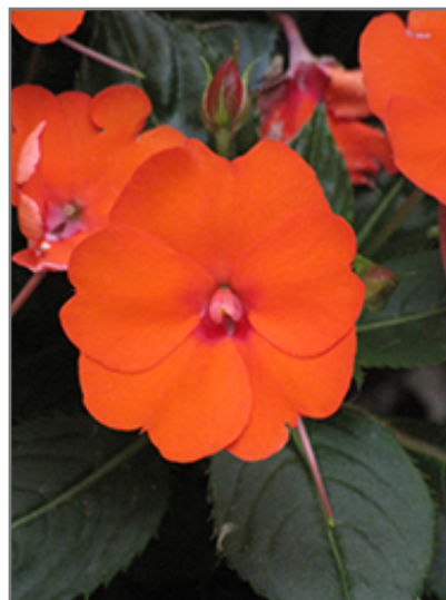
SunPatiens Compact Electric Orange New Guinea Impatiens flowers

This plant will require occasional maintenance and upkeep, and should not require much pruning, except when necessary, such as to remove dieback. It is a good choice for attracting bees and butterflies to your yard. It has no significant negative characteristics.