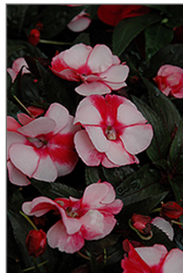
Sonic Sweet Cherry New Guinea Impatiens flowers