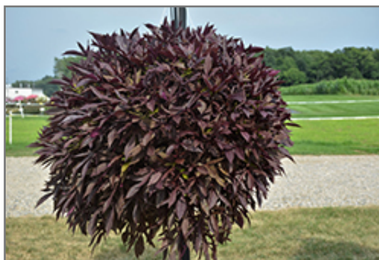
Illusion Garnet Lace Sweet Potato Vine