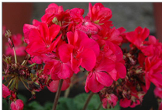
Savannah Punch Geranium flowers