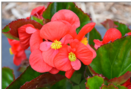
Big Red Green Leaf Begonia flowers