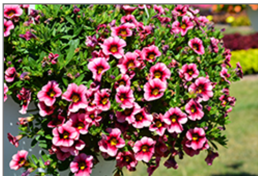
Hula Hot Pink Calibrachoa flowers

Hula Hot Pink Calibrachoa is recommended for the following landscape applications;