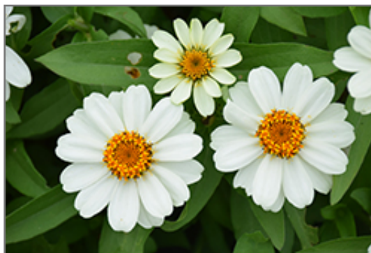
Profusion White Zinnia flowers