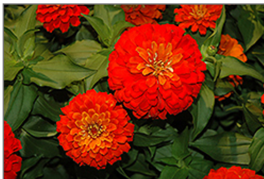
Dreamland Scarlet Zinnia flowers