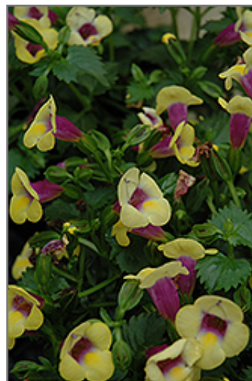
Yellow Moon Torenia flowers

Yellow Moon Torenia is recommended for the following landscape applications;