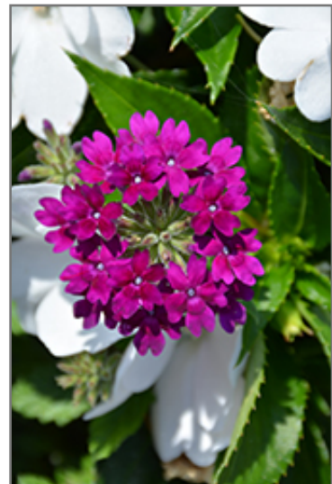
Superbena Royale Plum Wine Verbena flowers