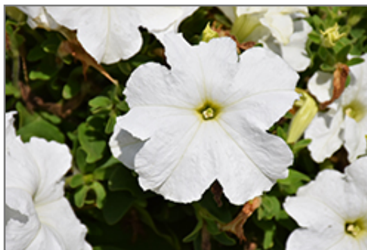
EZ Rider White Petunia flowers