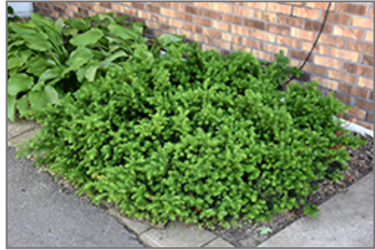
Emerald Spreader Yew

This shrub performs well in both full sun and full shade. However, you may want to keep it away from hot, dry locations that receive direct afternoon sun or which get reflected sunlight, such as against the south side of a white wall. It does best in average to evenly moist conditions, but will not tolerate standing water. It is not particular as to soil type or pH. It is highly tolerant of urban pollution and will even thrive in inner city environments, and will benefit from being planted in a relatively sheltered location. Consider applying a thick mulch around the root zone in winter to protect it in exposed locations or colder microclimates. This is a selected variety of a species not originally from North America, and parts of it are known to be toxic to humans and animals, so care should be exercised in planting it around children and pets.