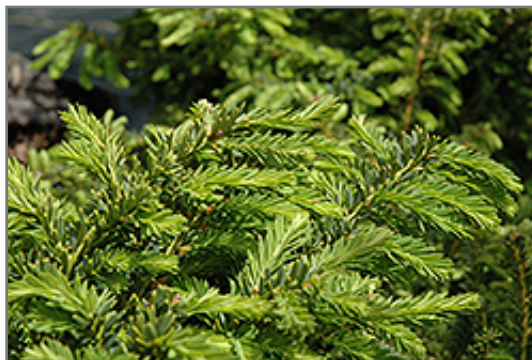
Emerald Spreader Yew foliage