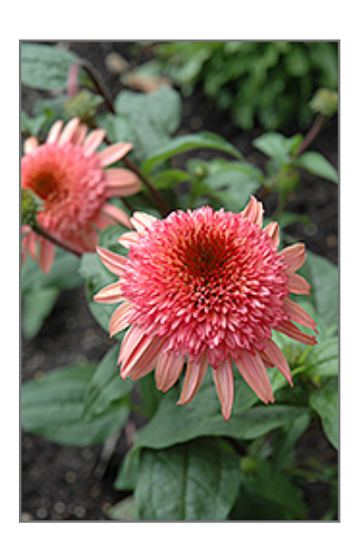
Cone-fections Raspberry Truffle Coneflower flowers