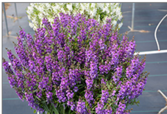
Serenita Purple Angelonia in bloom