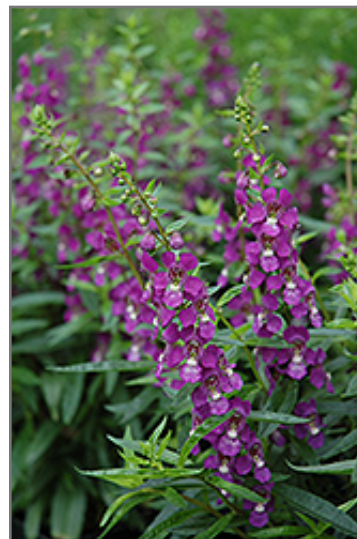
Serenita Purple Angelonia flowers