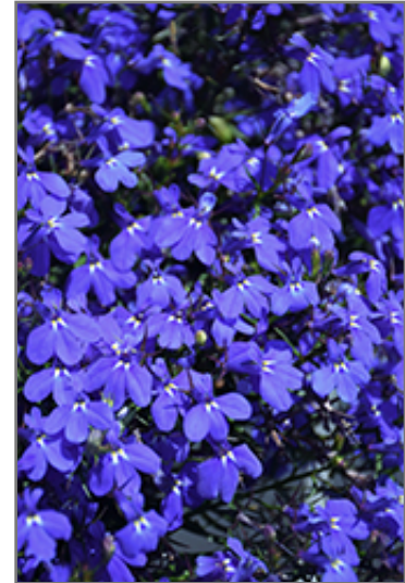
Techno Blue Lobelia flowers

Techno Blue Lobelia is recommended for the following landscape applications;