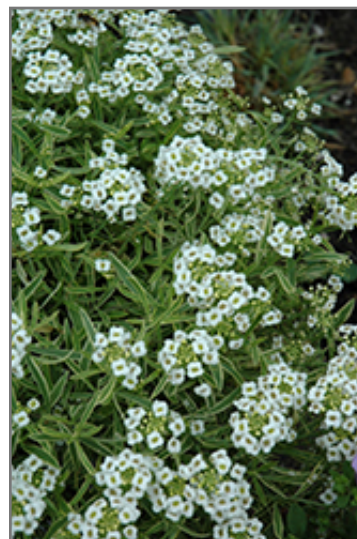
Frosty Knight Alyssum flowers

Frosty Knight Alyssum is recommended for the following landscape applications;