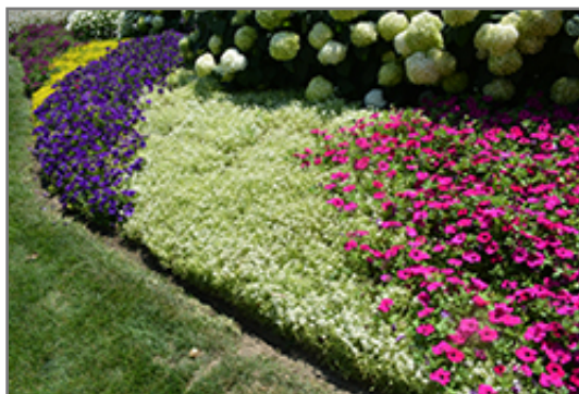
Frosty Knight Alyssum in bloom

Frosty Knight Alyssum will grow to be only 6 inches tall at maturity, with a spread of 18 inches. When grown in masses or used as a bedding plant, individual plants should be spaced approximately 15 inches apart. Its foliage tends to remain low and dense right to the ground. This fast-growing annual will normally live for one full growing season, needing replacement the following year.