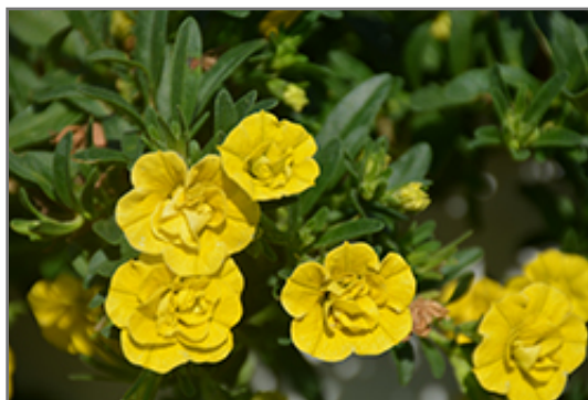
MiniFamous Double Deep Yellow Calibrachoa flowers

This plant will require occasional maintenance and upkeep. Trim off the flower heads after they fade and die to encourage more blooms late into the season. It is a good choice for attracting bees and hummingbirds to your yard, but is not particularly attractive to deer who tend to leave it alone in favor of tastier treats. It has no significant negative characteristics.