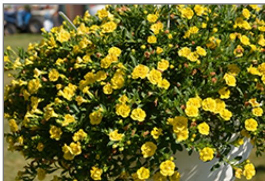
MiniFamous Double Deep Yellow Calibrachoa in bloom

MiniFamous Double Deep Yellow Calibrachoa is a fine choice for the garden, but it is also a good selection for planting in outdoor containers and hanging baskets. Because of its trailing habit of growth, it is ideally suited for use as a 'spiller' in the 'spiller-thriller-filler' container combination; plant it near the edges where it can spill gracefully over the pot. Note that when growing plants in outdoor containers and baskets, they may require more frequent waterings than they would in the yard or garden.