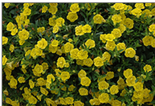
MiniFamous Double Deep Yellow Calibrachoa flowers