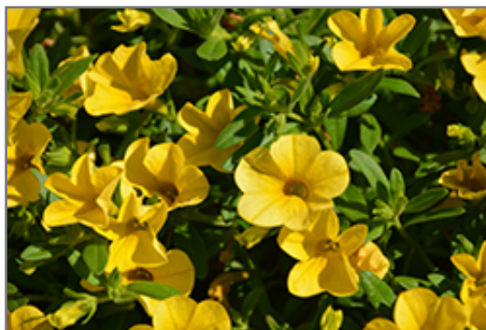
Cabaret Deep Yellow Calibrachoa flowers

Cabaret Deep Yellow Calibrachoa is recommended for the following landscape applications;