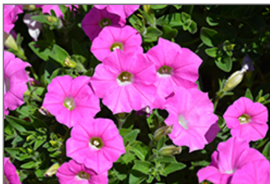
Shock Wave Pink Shades Petunia flowers