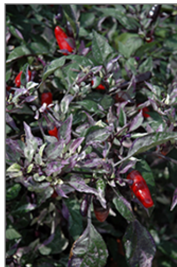
Calico Ornamental Pepper fruit