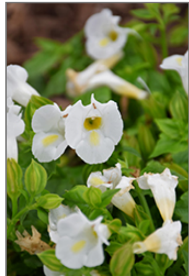
Catalina White Linen Torenia flowers