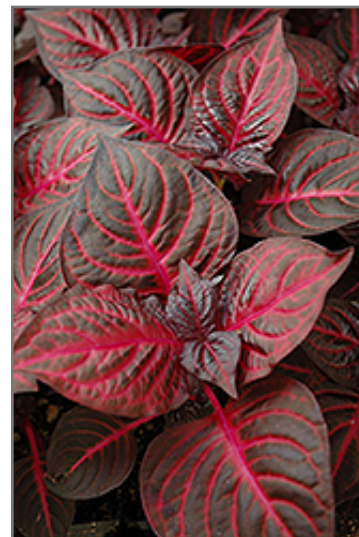
Blazin' Rose Blood Leaf foliage