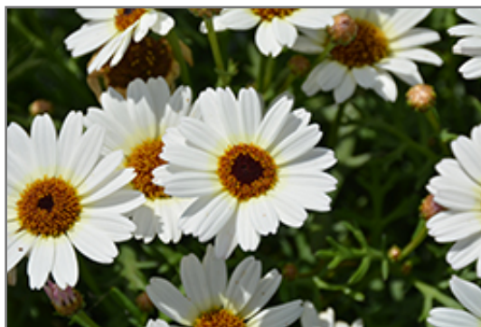
Madeira White Marguerite Daisy flowers