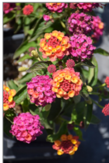
Lucky Sunrise Rose Lantana flowers

Lucky Sunrise Rose Lantana is recommended for the following landscape applications;