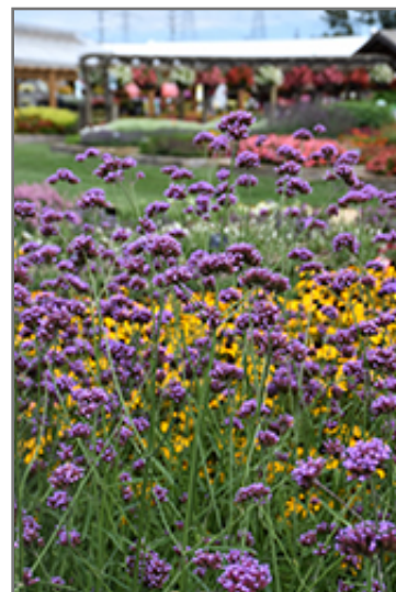
Buenos Aires Verbena flowers