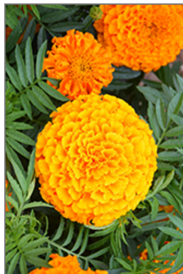
Taishan Orange Marigold flowers