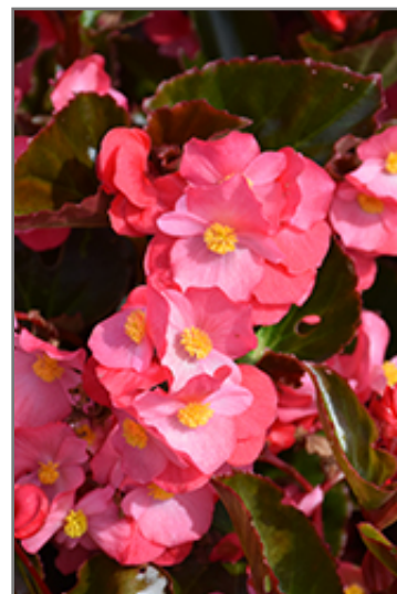
Big Rose Bronze Leaf Begonia flowers

Big Rose Bronze Leaf Begonia is recommended for the following landscape applications;