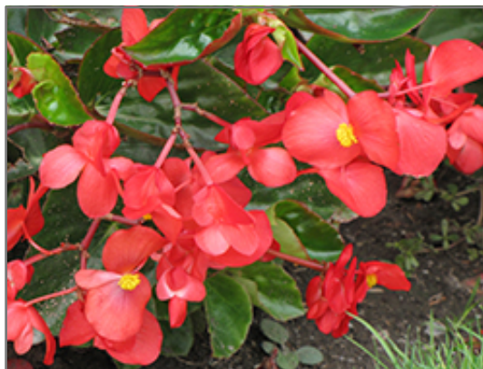
Dragon Wing Red Begonia flowers

Dragon Wing Red Begonia is an herbaceous annual with a trailing habit of growth, eventually spilling over the edges of hanging baskets and containers. Its medium texture blends into the garden, but can always be balanced by a couple of finer or coarser plants for an effective composition.