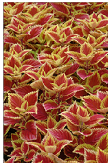
Trusty Rusty Coleus foliage