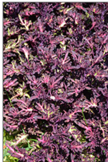
Merlin's Magic Coleus foliage