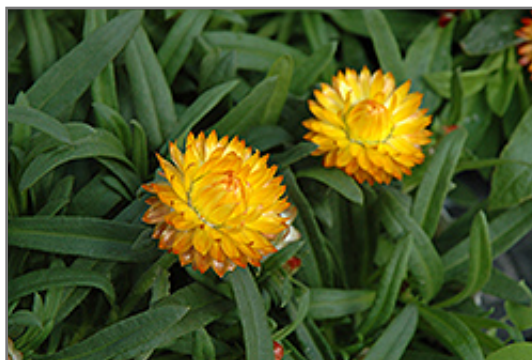
Basket Bon Bon Strawflower flowers