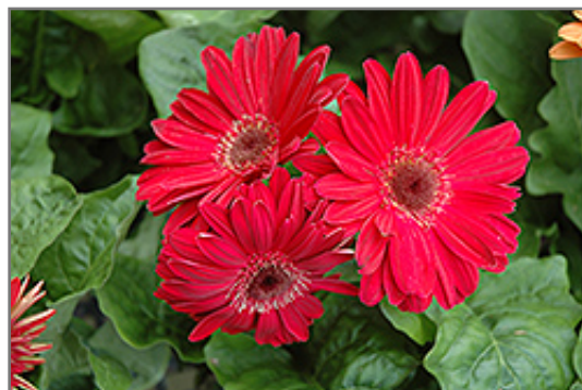
Fuchsia Gerbera Daisy flowers