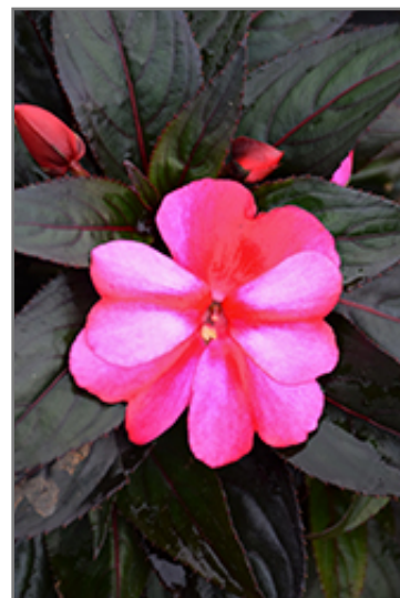
Sonic Sweet Purple New Guinea Impatiens flowers

Sonic Sweet Purple New Guinea Impatiens is recommended for the following landscape applications;