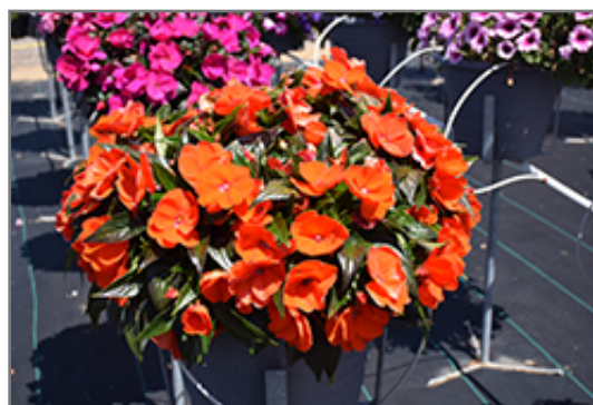
Sonic Orange New Guinea Impatiens in bloom