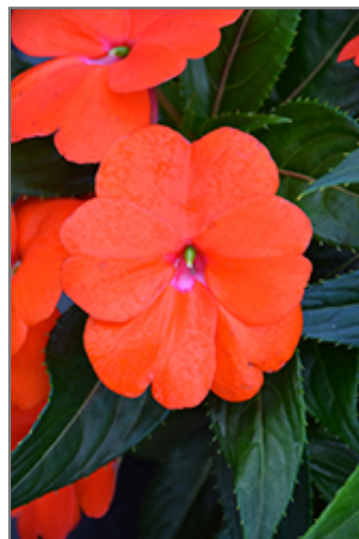
Sonic Orange New Guinea Impatiens flowers

Sonic Orange New Guinea Impatiens is a fine choice for the garden, but it is also a good selection for planting in outdoor containers and hanging baskets. It is often used as a 'filler' in the 'spiller-thriller-filler' container combination, providing a mass of flowers against which the thriller plants stand out. Note that when growing plants in outdoor containers and baskets, they may require more frequent waterings than they would in the yard or garden.