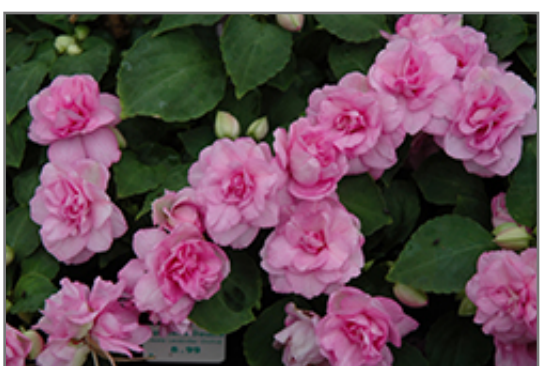
Fiesta Lavender Orchid Double Impatiens flowers