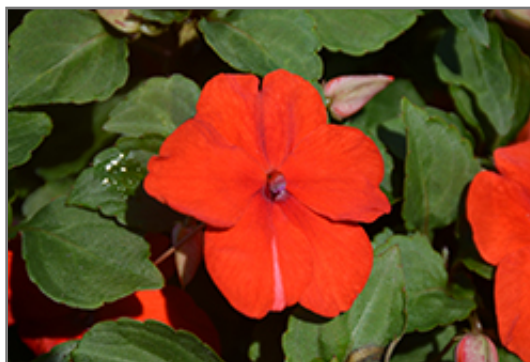
Super Elfin XP Scarlet Impatiens flowers

Super Elfin XP Scarlet Impatiens is recommended for the following landscape applications;