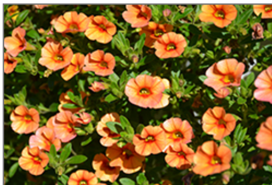
Can-Can Apricot Calibrachoa flowers

Can-Can Apricot Calibrachoa is recommended for the following landscape applications;