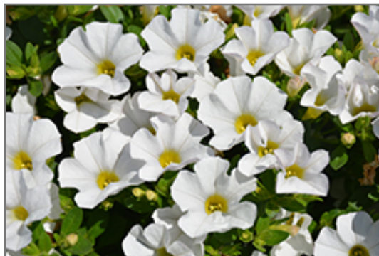
Cabaret White Calibrachoa flowers

Cabaret White Calibrachoa is recommended for the following landscape applications;