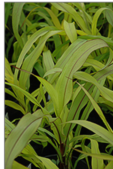
Jester Millet foliage