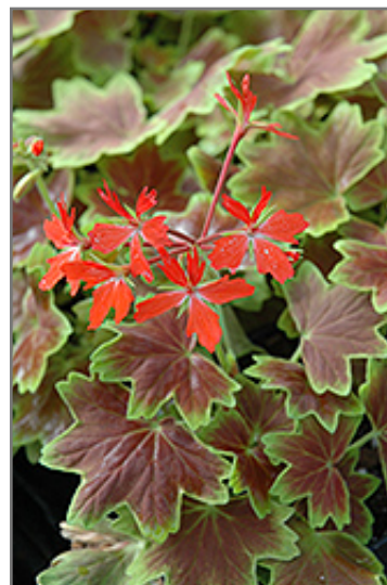
Vancouver Centennial Geranium flowers