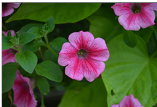
Supertunia Mini Strawberry Pink Vein Petunia flowers