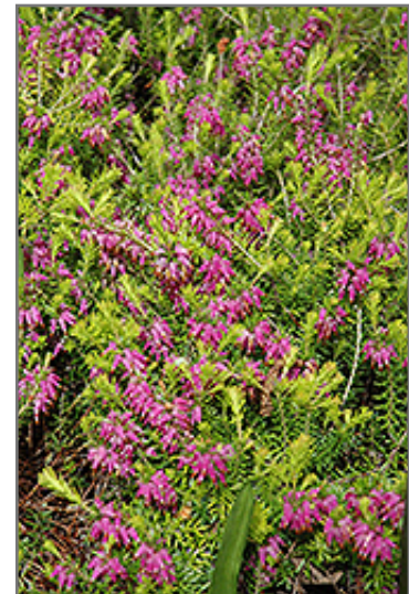
Myretoun Ruby Heath flowers